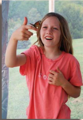
Education: Butterfly Open House Saturday creates a magical moment for a young lady.

Recognized as a beautiful destination, the nature preserve offers a park-like setting, historical buildings, recreational fields, demonstration gardens, educational opportunities, and overall family fun.