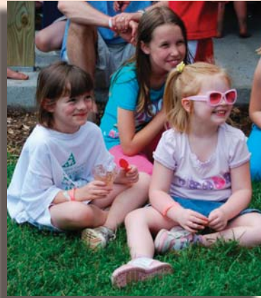
Family Fun at the Nature Preserve: These children enjoy a magic show at NatureFest 2010!