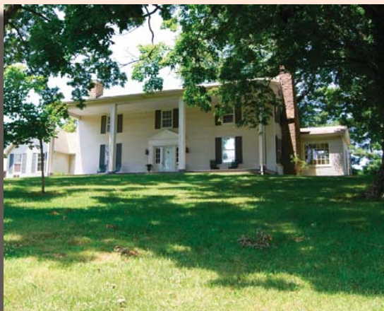
Mahan Manor is 1 of 7 buildings at the preserve; it is a 200-year old log cabin in need of restoring.

12501 Harmony Landing Rd. Goshen, KY 40026 Office (502) 228-4362 www.KYNaturePreserve.org